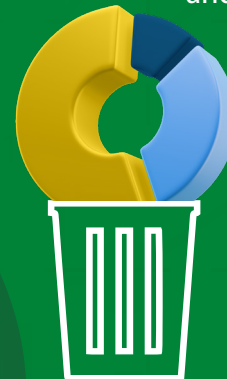
Chart junk (e.g., 3D effects, animations or extra labels) can distract people from the key message. Good data visualization is clear and minimalistic.